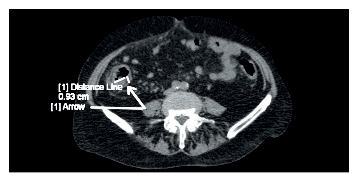
Figure 2. A 65 years old, COVID positive woman with abdominal pain. Enhanced CT in axial plane showing ascending colon wall thickening (arrow).